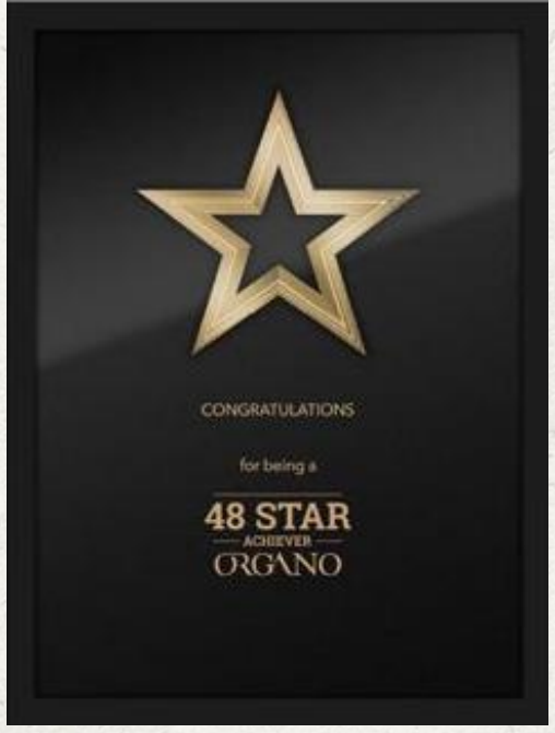
Incredible! Good Luck to all our Star Achievers!